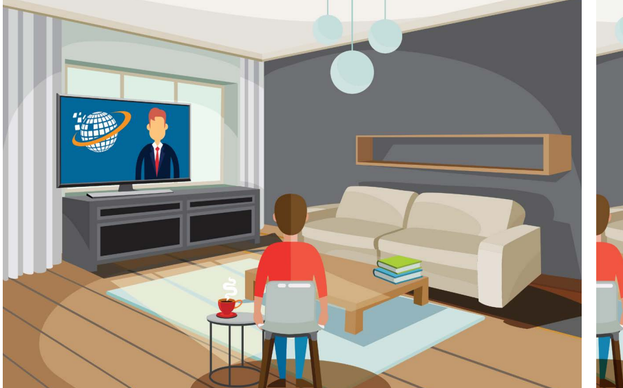
Normal visual attention indoors.

Left-sided inattention means an inability to automatically pay attention to information from vision, hearing and feeling to the left side. The difficulty in perceiving the information usually increases the further out to the left side the source of information is. The person has